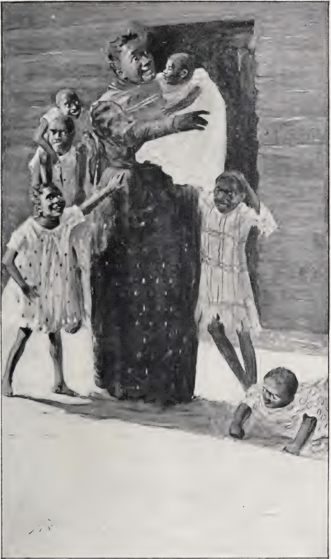
“WE . . . PASSED THE NEGRO HUTS, SWARMING WITH BLACK BABIES.”